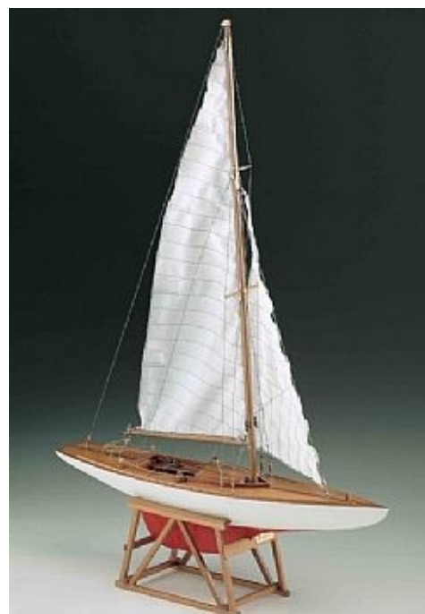
DRAGON CLASS YACHT

The Dragon is perhaps the most famous fixed keel monotype yacht in the international classes. Monotypes are regatta boats subject to strict rule which establish the shape, weight, dimensions, construction details and sail area.