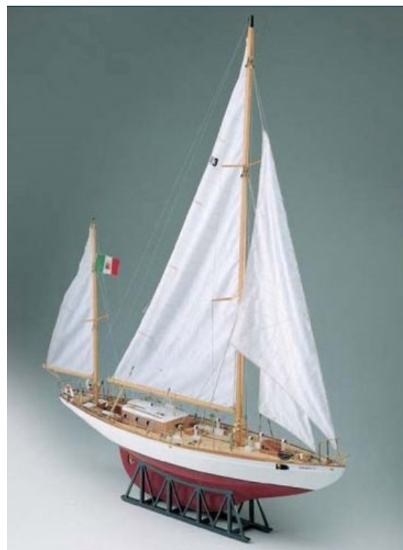
CORSARO II - 1961